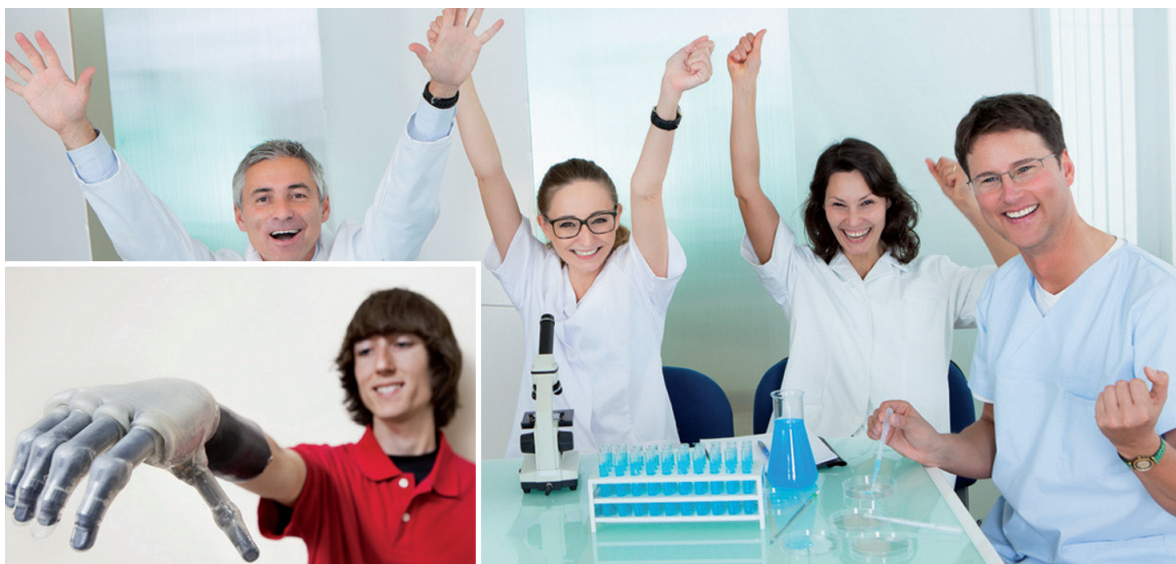
Some biomedical engineers spend their days designing, manufacturing, or testing mechanical devices such as prosthetics and orthotics, while others design electrical circuits and computer software for medical instrumentation.

Biomedical engineers are also working to develop wireless technology that will allow patients and doctors to communicate over long distances. Many biomedical engineers are involved in rehabilitation—designing better walkers, exercise equipment, robots, and therapeutic devices to improve human performance. They are also solving problems at the cellular and molecular level, developing nanotechnology and micro-machines to repair damage inside the cell and alter gene function. Biomedical engineers are also working to develop three-dimensional simulations that apply physical laws to the movements of tissues and fluids. The resulting models can be invaluable in understanding how tissue works, and how a prosthetic replacement, for example, might work under the same conditions.