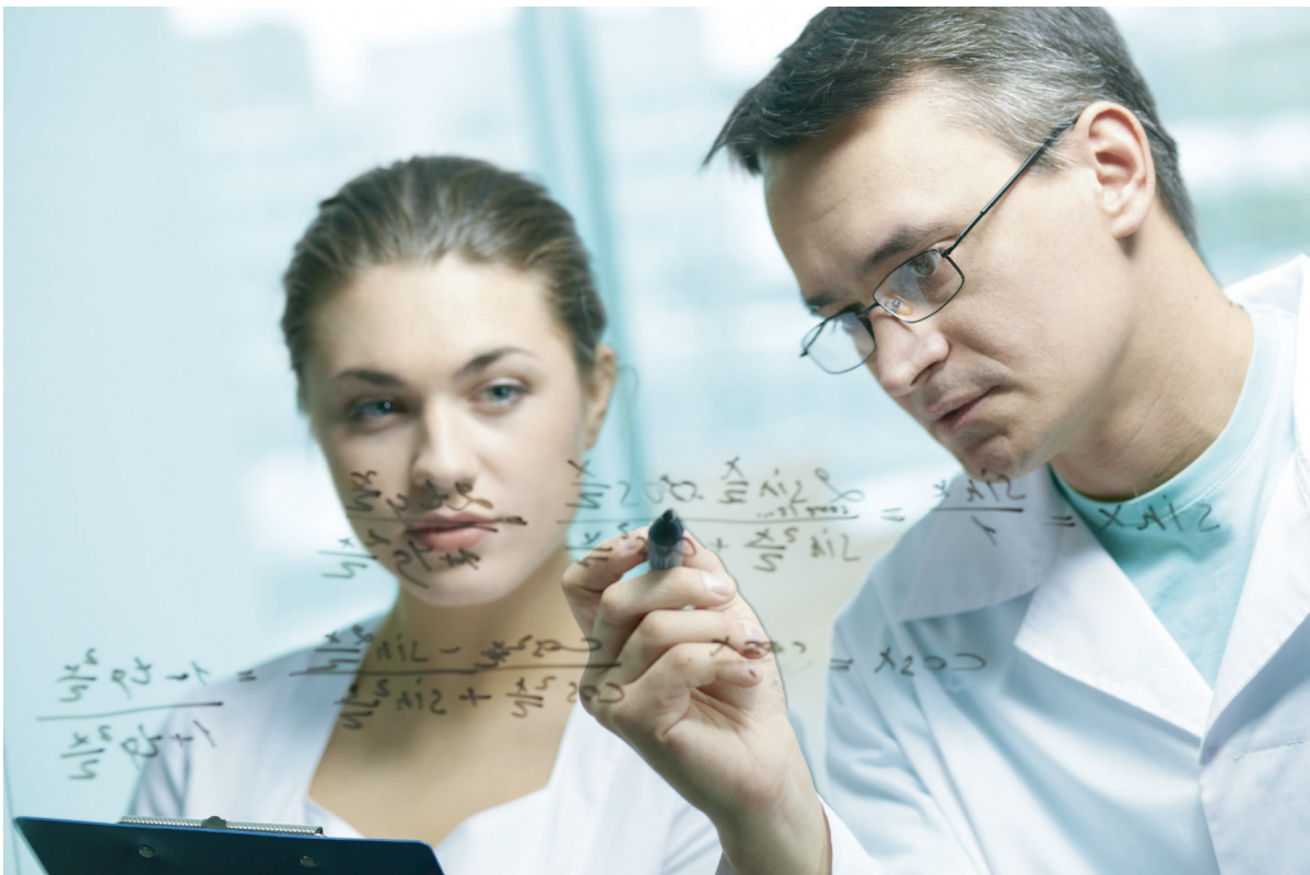
Biomedical engineering students also take a number of advanced science and engineering courses related to their specialty in biomedical engineering.

Many universities actively encourage six-month overseas exchange programs where a component of the biomedical engineering curriculum is taught by a university in another country.