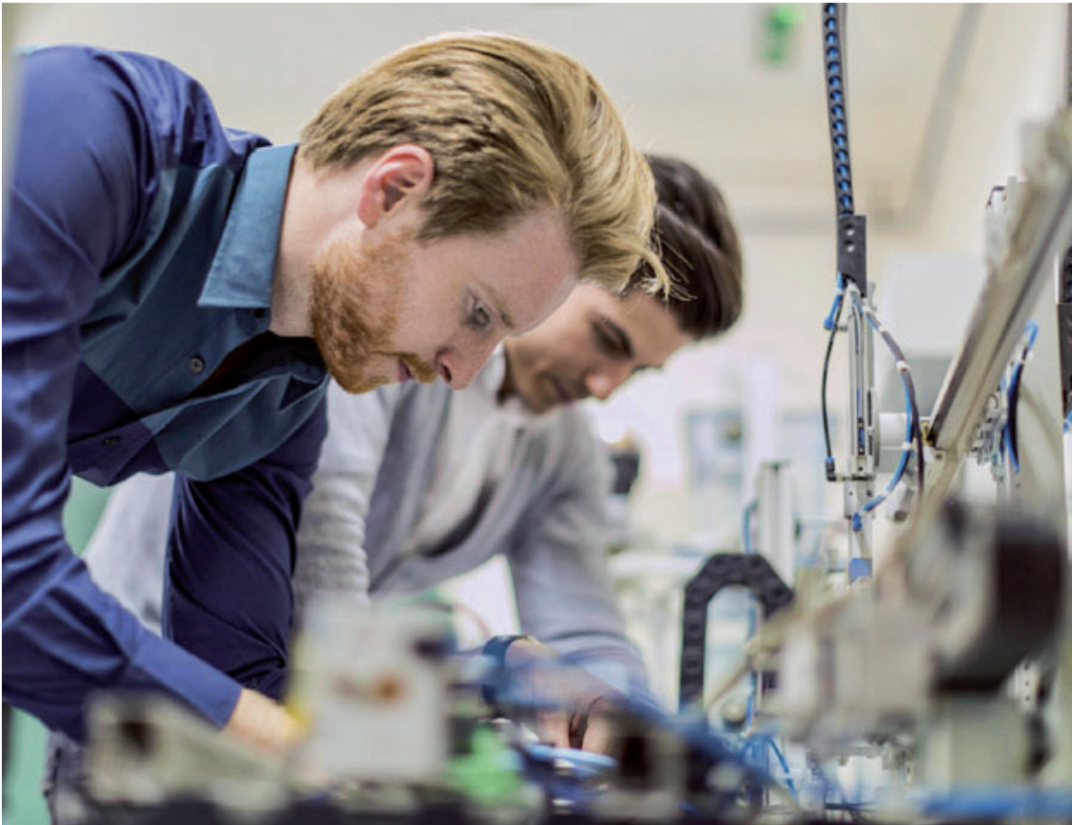
A significant number of biomedical engineering students engage in research in a faculty laboratory, beginning at a low level and working toward more intensive involvement in the laboratory's activities.

A significant number of biomedical engineering students engage in research in a faculty laboratory, beginning at a low level and working toward more intensive involvement in the laboratory's activities. Such experiences are excellent preparation for future graduate study and are especially valuable for students planning to go on to the MD or PhD degrees. However, usually students must proactively approach faculty in order to obtain these positions, as there are many more students desiring research than there are openings for undergraduates in research labs.